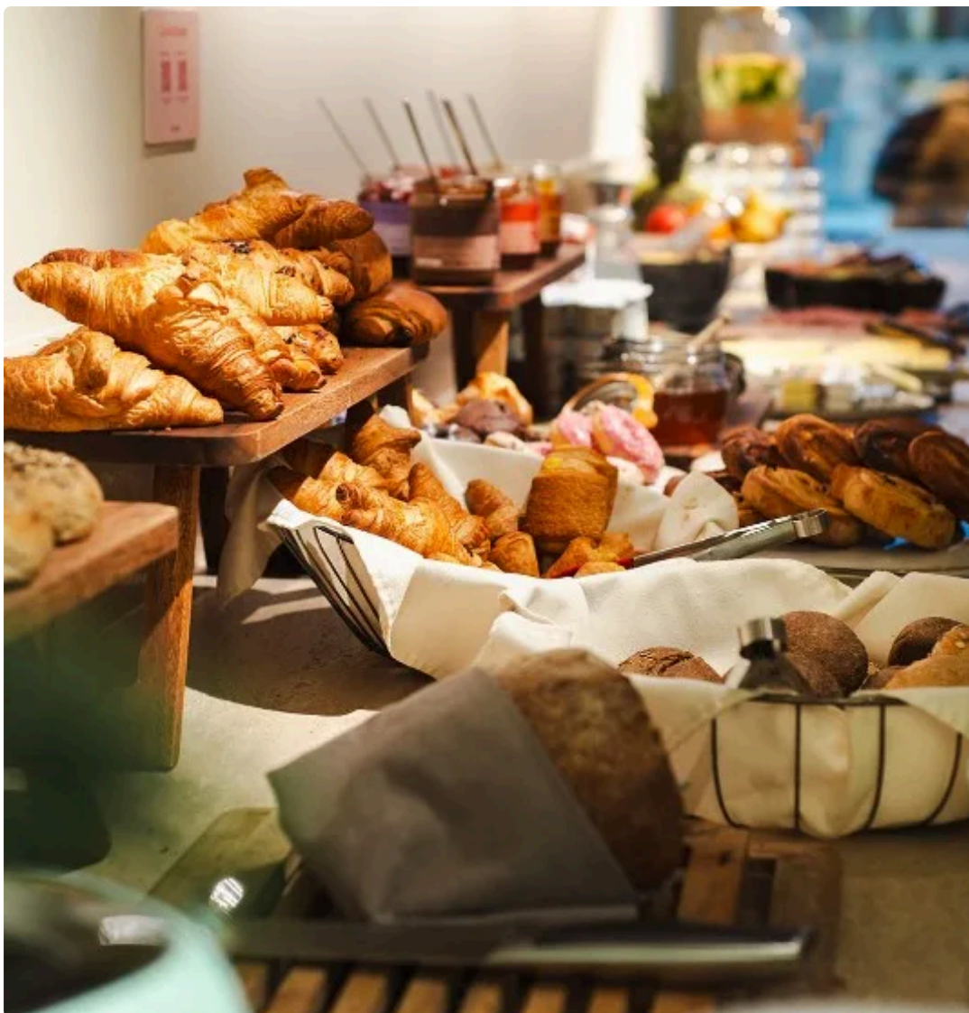
Fresh sourdough bread and rolls from Bakkerij Lonneville and Compaan.